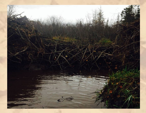
Beaver dam in Bell's Creek blocking 15 km of essential spawning habitat

Friends of Covehead-Brackley Bay Inc. (FCBB) is a community-based volunteer organization established in 2000, incorporated in 2001. It was formed by a group of community members concerned with the health and sustainability of the Covehead-Brackley watershed area. Its mandate is to create a watershed area that is healthy: one which nourishes the land and water, one which is sustainable to native flora and fauna, and also balances the interests of residents, including those working in aquaculture, forestry, agriculture, fisheries and tourism.